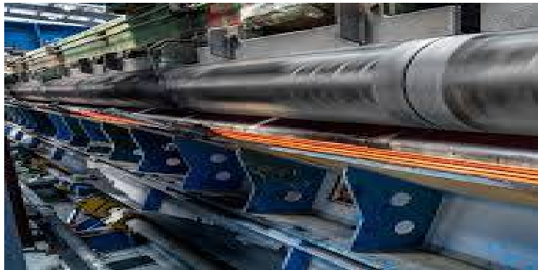
Figure 1. Wire rods.