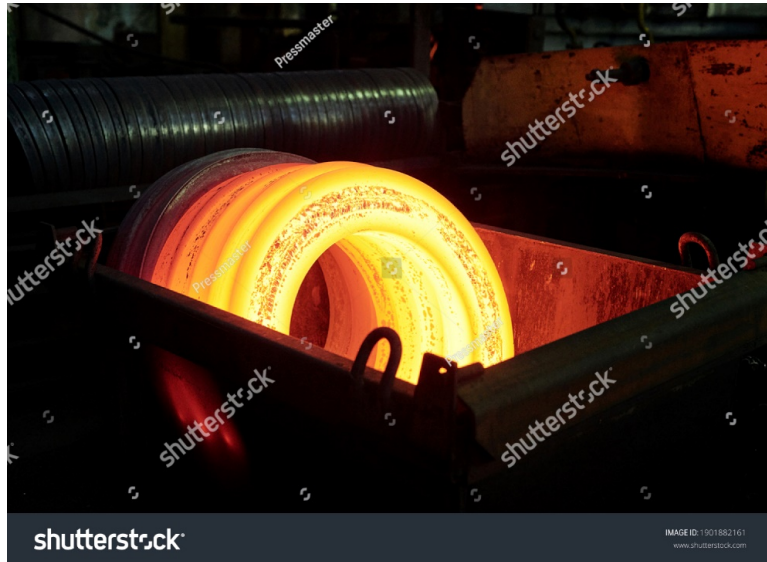
Figure 3. Rolling mill tubing.