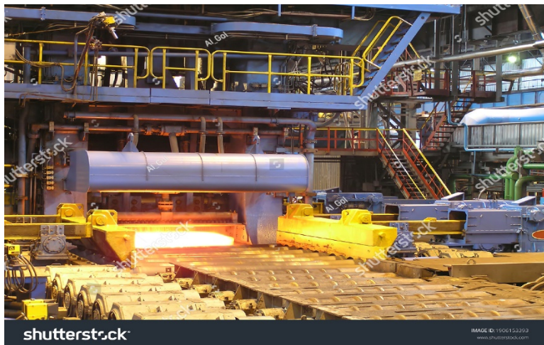
Figure 2. Flat sheets.