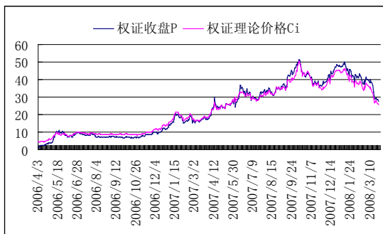
Figure 2. Wuliang YGC1-Market price and theoretical price comparison chart.