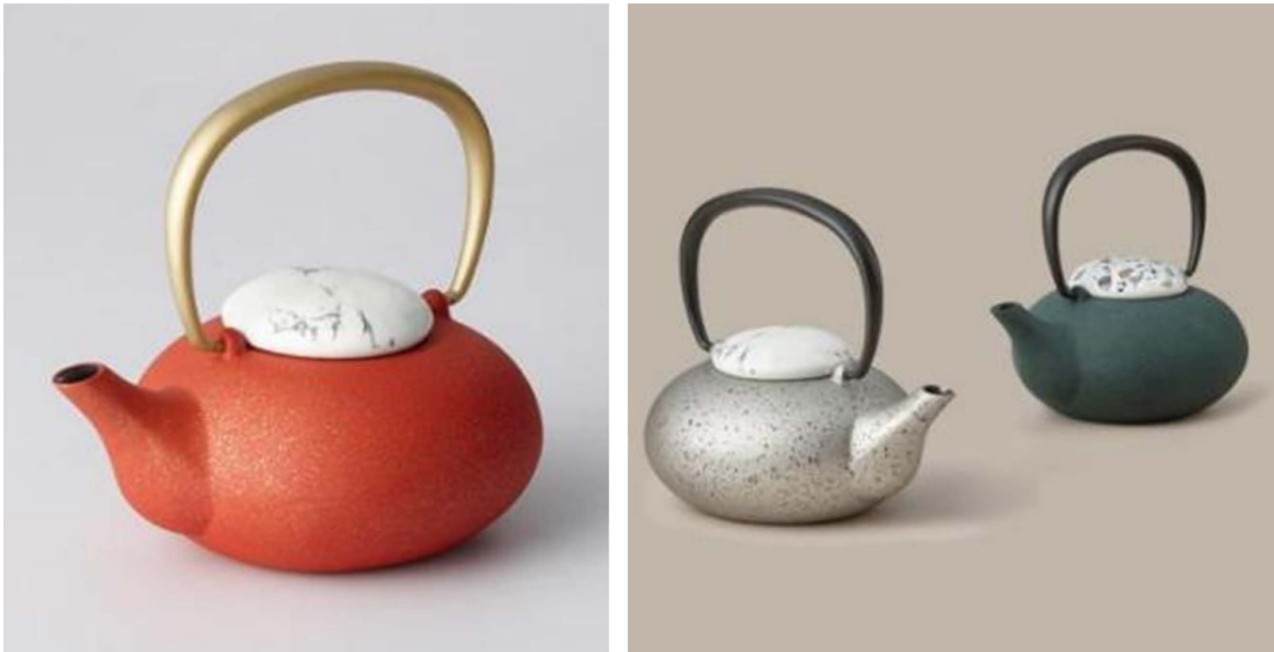
Figure 1. Kikuchi Hojudo's cast iron teapots.