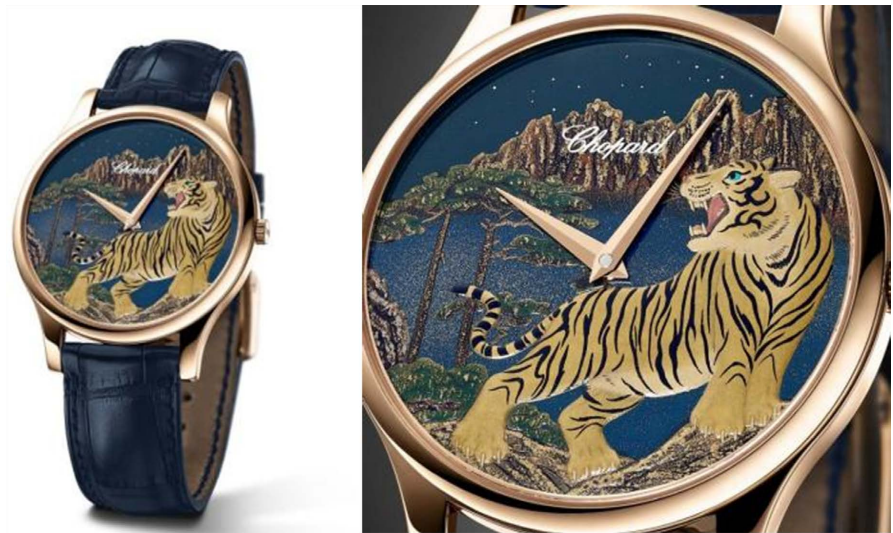
Figure 4. Chopard lacquer art watch.

modern design principles, promoting a fusion of tradition and innovation. This approach not only preserves the rich heritage of traditional crafts but also repositions them within the modern lifestyle, illustrating the potential of traditional beauty in contemporary design.