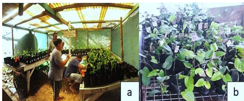
Figure 4. (a) Planting vine cuttings in the nursery (b) Sprouting vine cutting ready for field transplanting.

Vines were cut into 12 - 15 cm long, each bearing a pair of mature leaves and two nodes. The end of every vine was dipped into a fungicide (Mancozeb) solution. After treatment, the treated end of each vine was inserted into PB2 polybags filled with the appropriate growing media, and the medium was gently pressed around the vine cutting. The entire leafless portion of the vine was slantly buried under 2 - 3 cm of the growth medium leaving just the leafy tip above the medium and firm around. A watering can was used to distribute water to every cutting after planting ( Figure 4 , Figure 5 ).