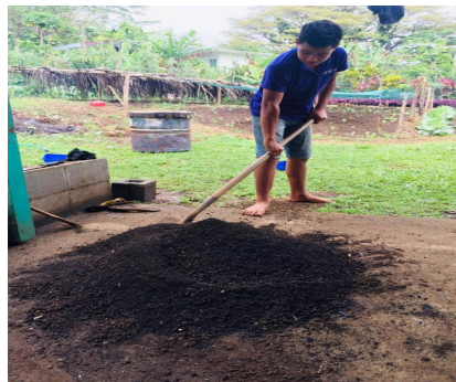
Figure 3. Mixing sterilized top soil and carbonised sawdust.

Five different growing media combinations of carbonized sawdust (CS) and topsoil (TS) were prepared which served as the different treatments for Experiment 1 ( Figure 3 ). Growth media combinations were as follows: 100CS:0TS, 75CS:25TS, 50CS:50TS, 25CS:75TS, and 0CS:100TS ( Table 1 ) and ( Table 2 ). Carbonized sawdust was prepared by heating the sawdust acquired from the market at 300^{\circ}\text{C} - 350^{\circ}\text{C} with a residence time of 1 hour and 30 minutes. While topsoil was collected from the field and sterilized using an oven. Both materials were cooled down then they were used to fill the PB2 polybags for planting the vine cuttings.