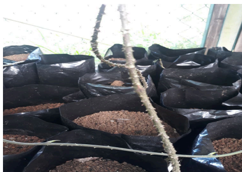
Figure 1. Sprouting minisetts of the three cultivars.

The sprouted setts ( Figure 1 ) were planted in the field with a spacing of 100 cm within rows and 100 cm between rows. A month after planting, each plant was allowed to climb on wire frameworks established along each plot to provide support ( Figure 1 ). These plants served as the source of the vine cuttings for the experiments.