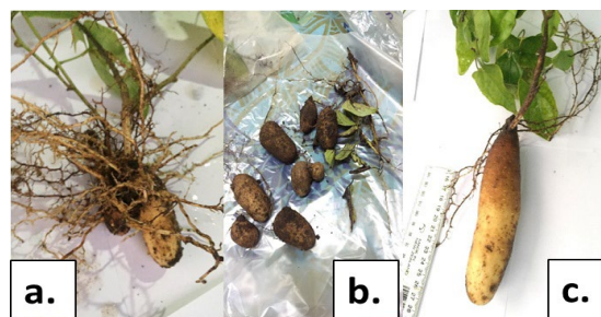
Figure 8. Tubers of different cultivars harvested from rooted yam cuttings (a) DN1; (b) DN2; (c) DR.