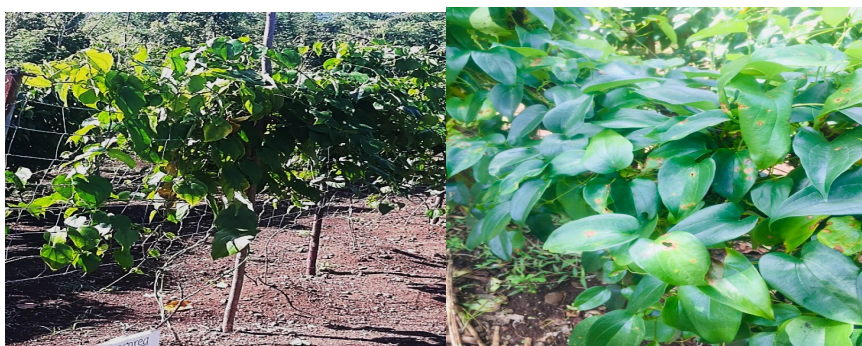
(a) Dioscorea nummelaria