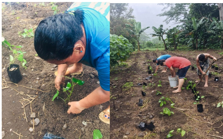
Figure 5. Transplanting of fully-grown yam from vine cuttings grown in the different growing media in the nursery to the field.