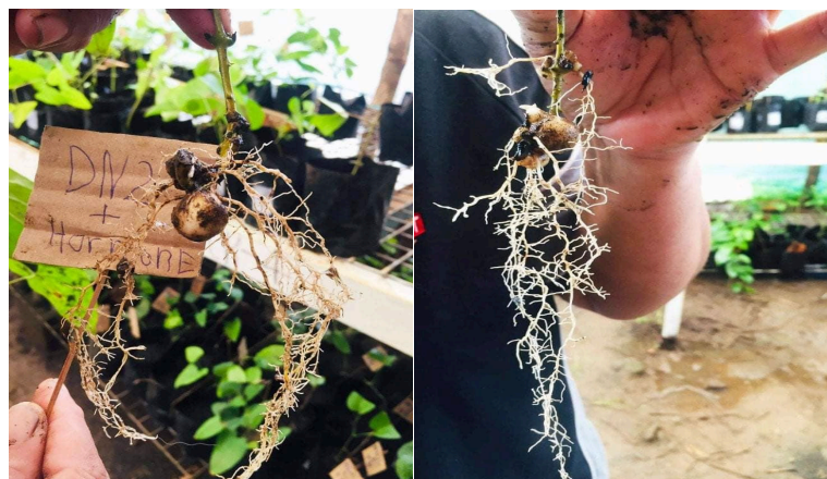
Figure 7. Minitubers initiated by yam vine cuttings grown in different media in the nursery.