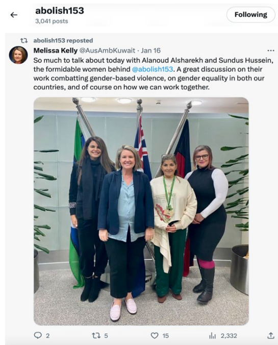
Figure 4. The Australian Ambassador to Kuwait engage in a formal discussion on gender-based violence, posting from her personal Twitter account with the feminist founders of the @abolish153 campaign. Retweet

Art Activism: To engage the public on a sensitive topic without alienating them, the campaign utilised art as a primary medium. Annual art exhibitions featuring the work of young Kuwaiti artists were held to confront the issue through cultural awareness, creating new narratives and fostering dialogue (Figure 5).