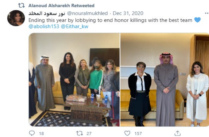
Figure 3. Activists from the Abolish 153 and Eithar Kuwait initiatives are meeting with members of parliament, demonstrating the campaign’s strategy of direct political lobbying.

Offline Advocacy and Lobbying: Feminist activists understood that digital presence alone was insufficient. They transitioned from online “rehearsal” to offline action, engaging in direct lobbying with members of the Kuwaiti parliament and relevant committees to push for legislative change. See the post below (Figure 3).