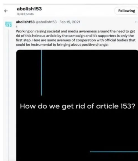
Figure 1. A post from the @abolish153 account clarifying the campaign's multi-pronged approach, which includes raising societal awareness.

The Abolish 153 campaign was initiated as a grassroots movement by a group of elites and educated women who leveraged their privileged positions to challenge these patriarchal laws. Recognising the complexity of legal reform, their top-down strategy was multi-faceted, combining digital activism with offline advocacy. As one of the founders, Alanoud Al-Sharekh, stated, "I believe that advocacy is the way to change policies and laws. This is of utmost importance when it comes to ending gender-based violence." The campaign's strategies included: