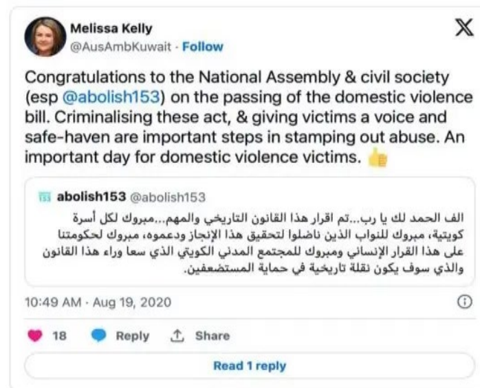
Figure 6. The Australian Ambassador to Kuwait acknowledges the passage of the Family Protection Law and explicitly credits civil society for its hard work, citing the @abolish153 campaign.