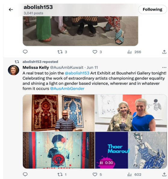
Figure 5. A post from the @abolish153 account clarifying the campaign's multi-pronged approach, which includes raising societal awareness and cooperating with official bodies to enact change.

Art Activism: To engage the public on a sensitive topic without alienating them, the campaign utilised art as a primary medium. Annual art exhibitions featuring the work of young Kuwaiti artists were held to confront the issue through cultural awareness, creating new narratives and fostering dialogue (Figure 5).